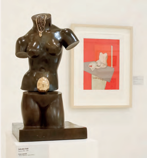
Salvador Dalí, Venus Spatiale , 1984 © Salvador Dalí, Fundació Gala-Salvador Dalí, VEGAP, Marbella, 2023